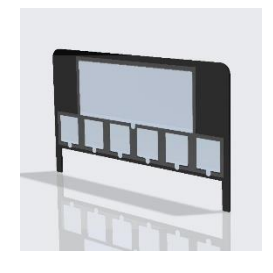
Exchangeable brand merchandizer 91 x 297mm Exchangeable product labels 45 x 45mm